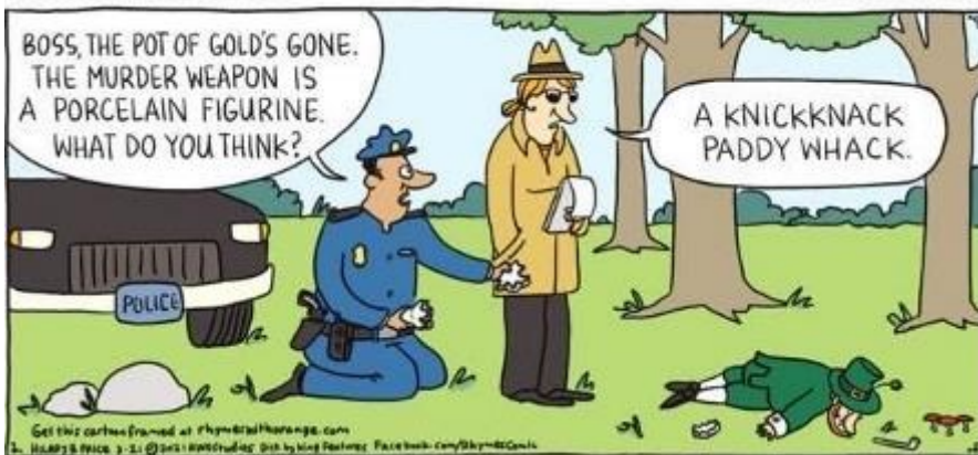
BY HILARY B. PRICE