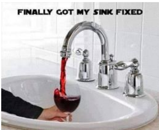
This is my favourite of all time