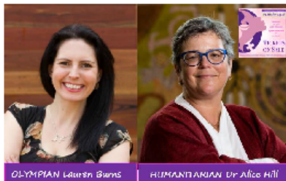
OLYMPIAN Lauren Burns

A history-making Olympian & a highly accomplished Humanitarian are the two inspirational keynote speakers at the Rotary International Women's Day Breakfast at Mornington Racecourse on Wednesday 4 March 2020