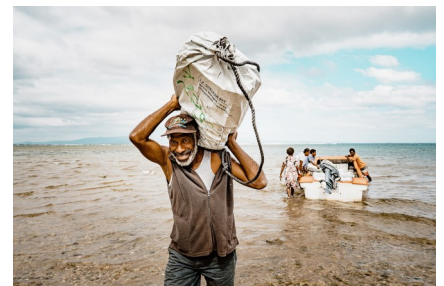
Vanuatu – Cyclone Harold