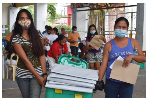
Phillipines - Typhoon Vongfong