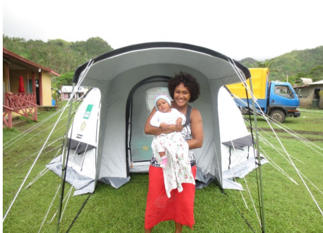
Fiji – Cyclone Winston

To find out more about the work of ShelterBox and promote shelter as a basic human right, please visit www.shelterboxaustralia.org.au