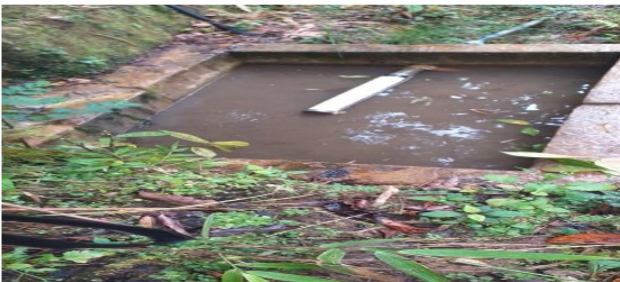
Photo of Sump that needs to be capped to finish Komea PNG Water project