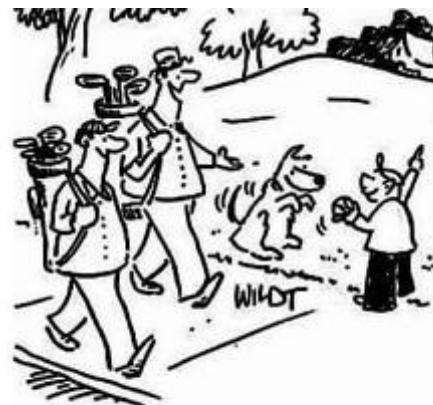
"That silly dog spends HOURS chasing that little ball!"

He considered this for a moment and replied: "When Abe Lincoln was your age he was The President of the United States."