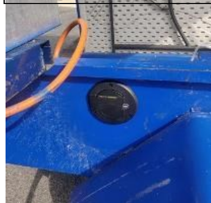
External Lockable Tank Filler Point