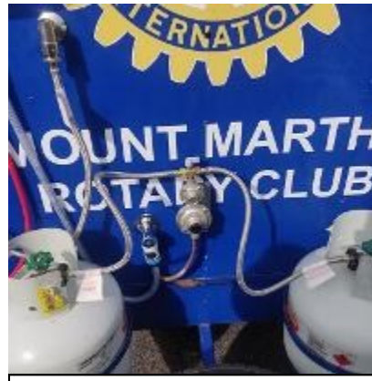
Compliant Regulator & Two way