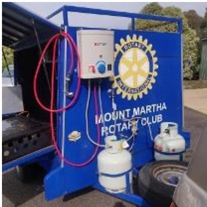
Operating mode showing Hot Water System