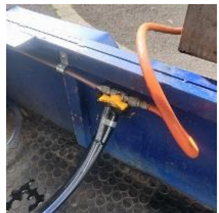
Isolation valve - 3 of them