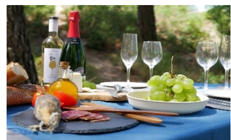
This Photo by Unknown Author is li-