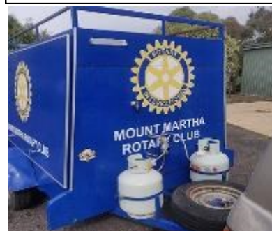
Now all ready to Travel to its next BBQ