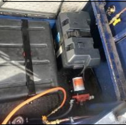
Battery & Pump