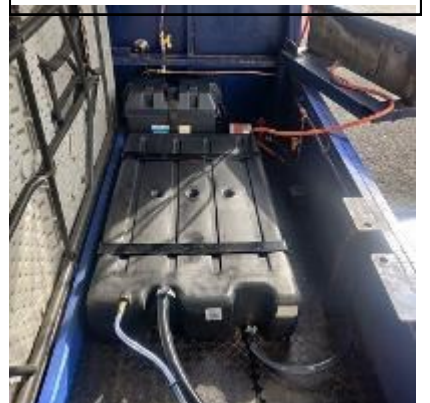
Tank, Battery & Pump