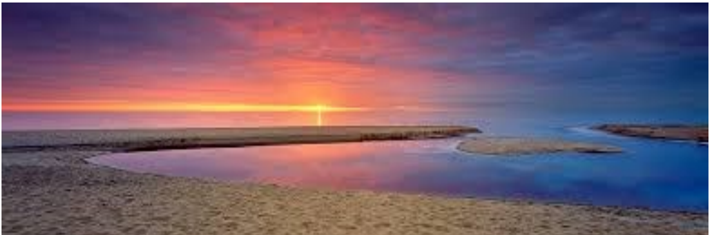
Two contrasting sunsets taken on the same night at Mount Martha recently